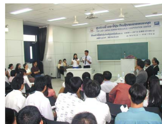
Students show their Japanese skills to the participants at the ceremony

The ceremony of completion for the year 2002-2003 of Japanese Language Course, was held on the 5 th of August. In this course year, around a hundred and forty students, who passed the final examination, were awarded the Center certificates.