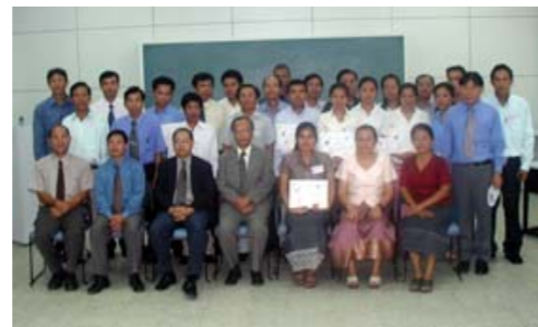
Ceremony of completion on 12 August for intensive course from 7 July to 12 August