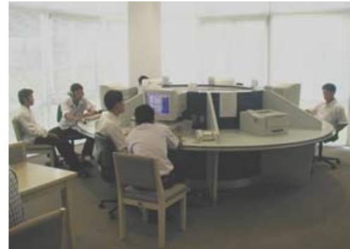
Computer facilities in Media Room