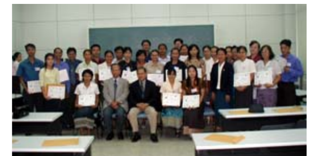
Ceremony of completion; the 3 rd Term 2003 Computer Course for NUOL staff

The Center held a ceremony of completion for the 3 rd Term 2003 Computer Course for the University staff, which terminated on the 16 th of July. Thirty eight participants received certificates.