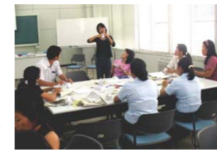
From the last Origami class

Origami is one of the Japanese traditional artwork, called folding papers.