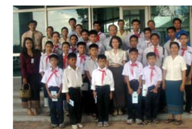
School children and the Center staff

On the 14 th of August twenty school children made an official visit to the Lao-Japan Center in a JICA study tour program. The children, from four provinces in Lao PDR, competed in a drawing contest, which was held by the Lao Youth Union, with the cooperation of the JICA and were awarded participation in the tour program.