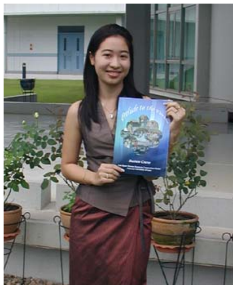
A Business Course participant with a brochure

A Business Course brochure, 'Prelude to the Future', was issued in August. The brochure provides useful and effective information on the course such as subjects and lecturers profiles. The intended target for the brochure are persons in charge of personnel management and staff training. The brochure is currently being distributed to both public and private sectors in Laos.