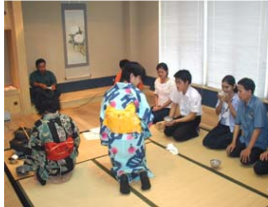
Traditional tea ceremony in Cultural Exchange Room

While enjoying Japanese conversation, the teachers demonstrated their traditional tea ceremony in the Cultural Exchange Room where Lao students sampled Japanese tea in the traditional style.