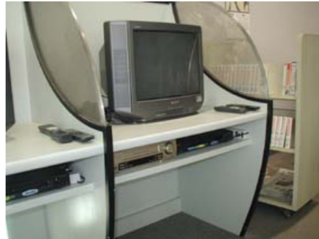
DVD/VCD/CD players in Media Room

Five new DVD/VCD/CD players were located in the Media Room where visitors can enjoy them with some software available. The Center plans to upgrade multimedia facilities furthermore.