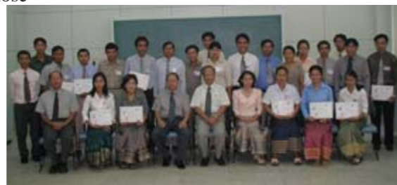
Ceremony of completion on 26 August for intensive course from 13 July to 26 August