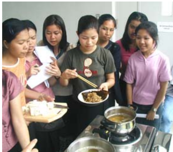
Participants cook Misoshiru , Japanese soy soup

The Japanese Language Course held a special class for its students on Saturday 5 th of July. It instructed the students how to cook and eat Japanese food; Onigiri and Misoshiru .