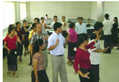
Participants learn Lao traditional dance

The Lao-Japan Center held a Lao dance training program on the 12 th and 19 th of July. Participants learned many kinds of Lao traditional dances from professional instructors. The Center has a plan to introduce Lao dance as one of cultural exchange programs to foreigners in Laos.