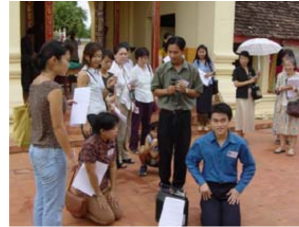
Practical tourist guide training in That Luang

The Japanese Language Course organized a short-term training course for tourist guides from the 11 th to the 26 th of August.